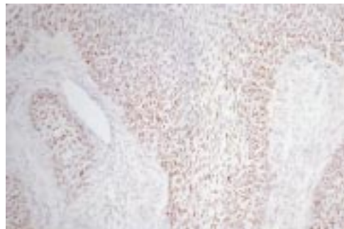
Figure 4 A routinely processed section of squamous cell carcinoma of the oesophagus stained with the monoclonal antibody Ab-6 (clone DO-1) with no form of antigen retrieval. Ninety eight per cent of the tumour nuclei are stained positive (brown) for p53 protein.

polyacrylamide gels. 35 Mutations identified by SSCP can then be sequenced, using PCR amplified DNA strands recovered from the detecting gel (fig 3).