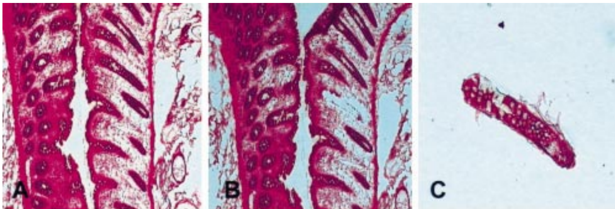
Figure 2 Frozen section of normal colon, stained with haematoxylin and eosin. (A) Before microdissection and (B) after microdissection; (C) captured tissue adherent to the cap.

Recognising that formalin fixation has a predictable adverse effect on nucleic acids, Maitra and co-workers devised a method of enrichment of epithelial cells for use in conjunction with LCM, which they termed EASI (epithelial aggregate separation and isolation). In their illustrative paper, fresh samples of carcinomas (breast, lung, colon, and prostate) were used. LCM was performed in the usual way and molecular analyses were then carried out, using PCR based assays. In the case of a colon cancer, amplification products were compared between formalin fixed tissue, methanol fixed "EASI-prep" tissue, frozen tissue, and a cancer cell line. DNA from the formalin fixed tissue failed to amplify products beyond 268 bp, whereas DNA from the EASI-prep sample amplified products up to 989 bp. The DNA obtained was used for loss of heterozygosity studies, single strand conformational polymorphism assays, and sequencing studies. With regard to RNA preservation, RNA suitable for