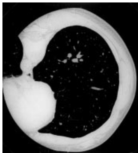
Figure 1 Enhanced computerised axial tomography of the left lung. Note the multiple small nodules.

Biopsy specimens were obtained from greyish miliary sized lesions, which were seen to protrude slightly from the lung surface by video assisted thoracoscopy. The tumour was diagnosed as PEH. Up to the time of writing, no tumour metastases to other sites have been detected.