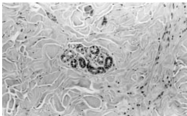
Figure 2 Haematoxylin and eosin stained section (original magnification, \times 100 ) showing later stage morphoea. Thickened collagen bundles fill the reticular dermis in the vicinity of an eccrine gland that has lost the normal surround of adipose tissue.

Manhattanville, New Jersey, USA). All DNA extracts were tested by PCR with primers for \beta globin to ensure that DNA of sufficient quality and quantity was obtained for subsequent analysis.